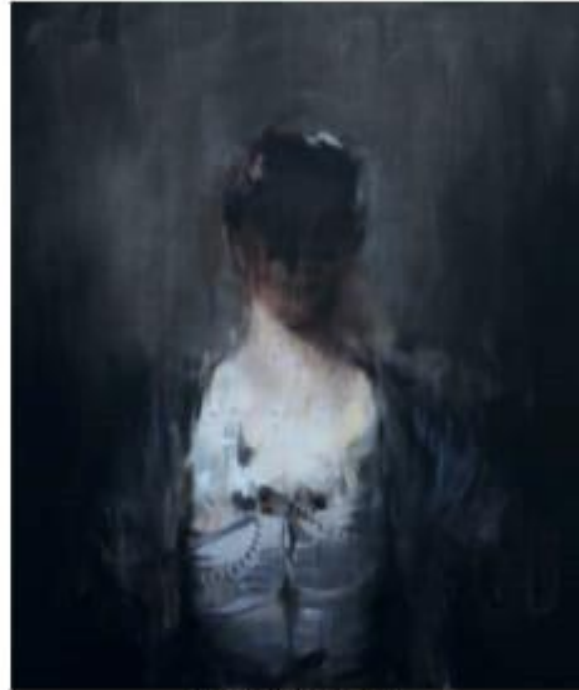
Jake Wood-Evans Portrait of a Woman in a White Silk Dress, after Reynolds